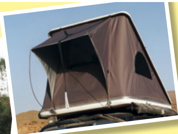
Trekking Tango . One opening but a large rear awning that can ventilate the tent even when it rains in torrents . Hardly less well finished than Columbus, the Chinese tent is also much less expensive (just over 600 € difference).