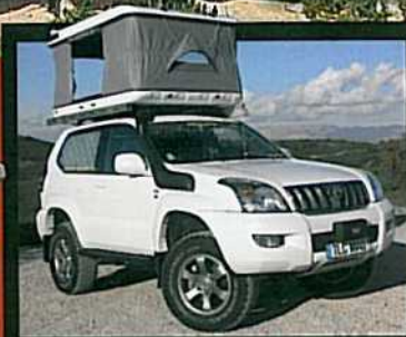
DOSSIER TENTES DE TOIT À COQUES RIGIDES