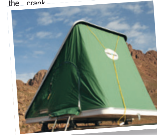
Columbus Classic. Portfolio opening with two side doors. A good product that deserves some small improvements to be perfect .

Hard shell rooftop tents have the enormous advantage of being able to fold and unfold quickly and without complicated handling ... as long as the system implementation is not bad ! There are two opening systems " crank " or "automatic" . On the first system, the crank