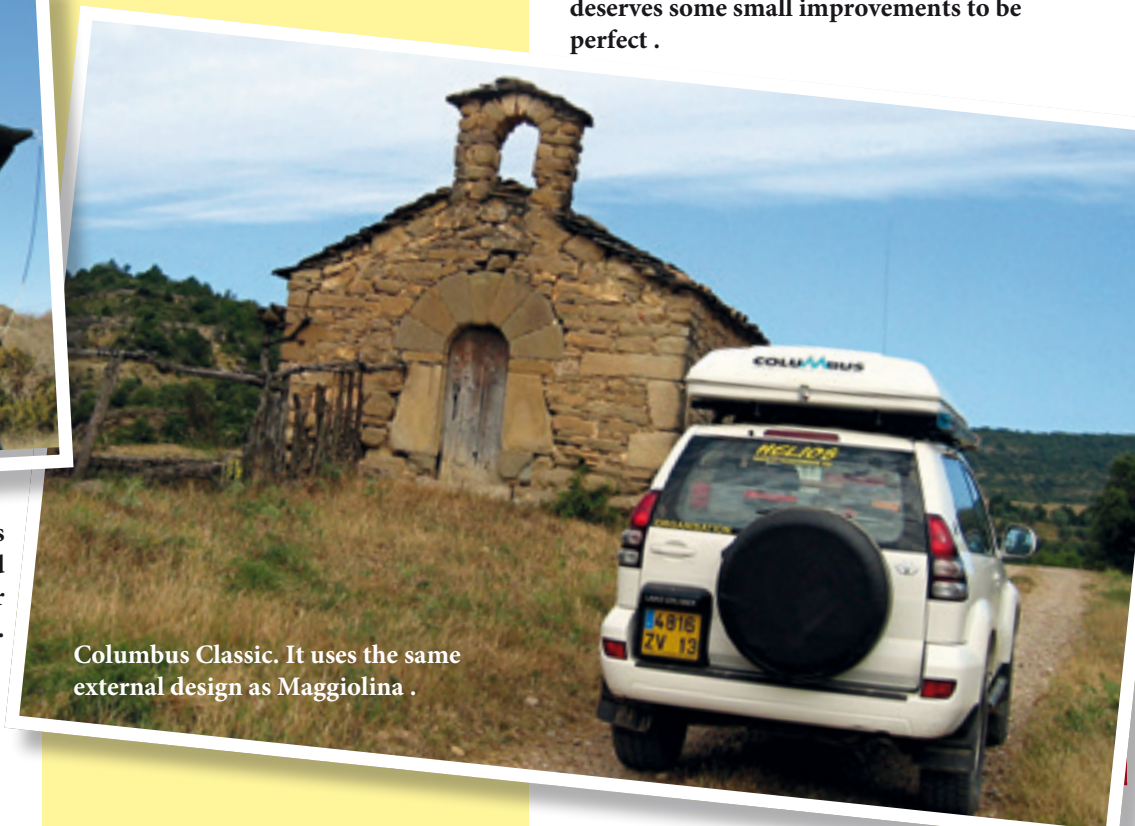
Columbus Classic. It uses the same external design as Maggiolina .