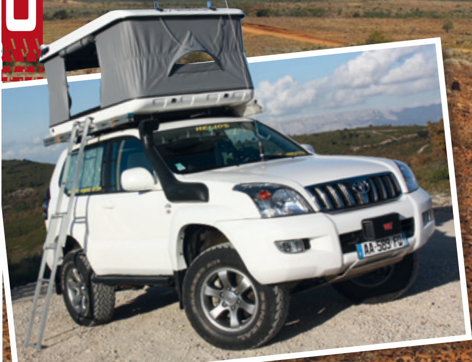
James Baroud Evasion. The First automatic tent with horizontal opening. When she appeared on the market in 2004, it was immediately acclaimed by all professionals 4x4. So much so that the manufacturer found himself quickly out of stock.

4) Columbus Classic Automatic first attempt of the company Autohome to draw a straight line from the famous Bivouac designed by Trekking in the 80's.