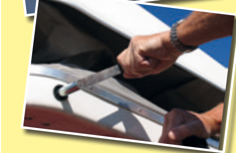
The pantograph of a crack opening tent.