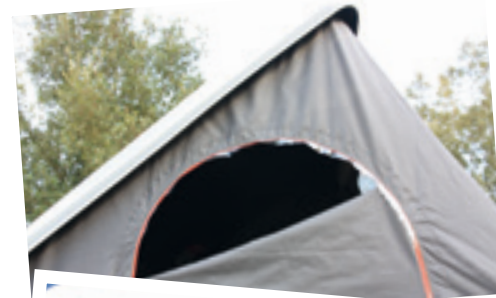
The openings in the Columbus and Magiolina are pretty basic . In case of rain, we have to close everything.