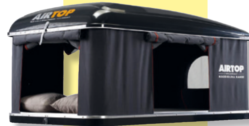
Air Top Maggiolina. The first automatic opening roof top tent of Autohome

The quality of the room should not be limited to sealing criteria. It has to be optimal in terms of ventilation to avoid the effect of condensation. Ergonomics and design of openings and air vents are critical! As well as their number and arrangement. Unless you cut in a special membrane (and expensive! ) As Goretex , the fabric of a single-walled tent is never completely breathable . So if the weather conditions are not favorable , the condensation is almost inevitable unless effective openings or VMC (mechanically controlled ventilation) are available as are found on boats or tents James Baroud . For a vent or a door to be truly effective, they must overcome beings mini awning (or awning protection). This protection prevents hearing or opens up the door even in heavy rain. "Traditional" tents used by hikers and climbers are all equipped with the famous awnings protections. It does not apply to