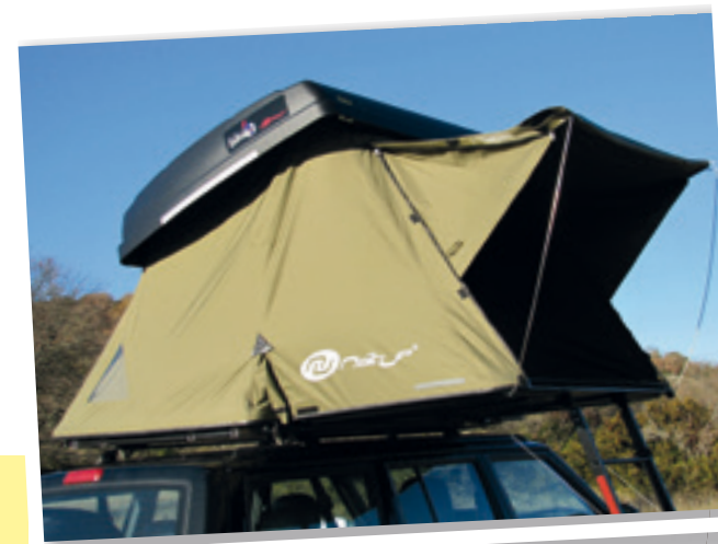
Naït Up hussar . A hybrid tent that it is difficult to store in a well- defined category.This Product is probably great for camping at beach but is not suited to 4x4 .