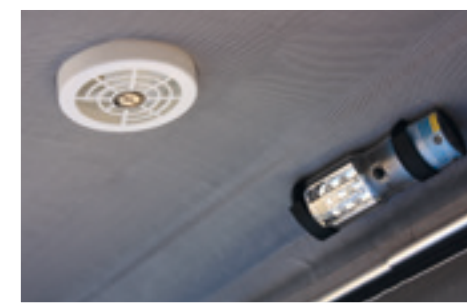
All the " evolution" James Baroud models are equipped with the VMC.

Essential element of the bed the mattress needs to be thick enough and good density per square meter to ensure a comfortable fit. Some manufacturers still dare to deliver tents with mattresses 3 or 4 cm thick , but overall , serious brands do not provide mattresses lower than 7 or 9 cm.