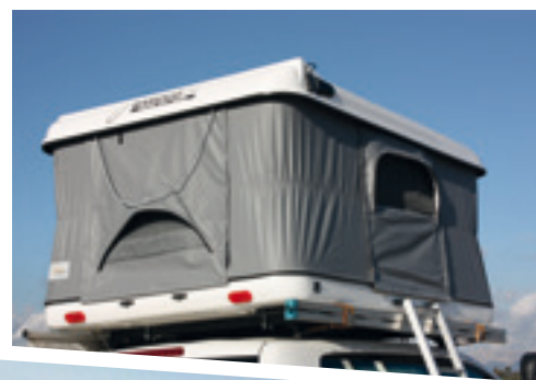
Trekking Capri. Another Chinese tent distributed by Trekking, this tent with side opening is associated with a good size annex . An innovative concept that , for the moment, we do not have much feedback .