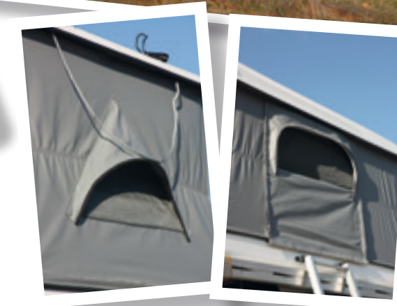
overcome tees with a awning of protection. A little more useful when you're in the rain or snow.