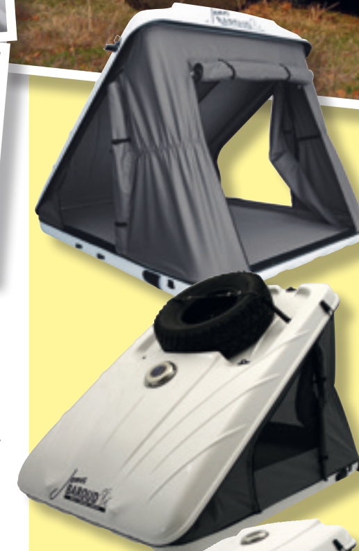
James Baroud Discovery. 3 déclinaisons, de la Classic à l'Espace en passant par l'Evolution. Espace et performance sont encore au rendez-vous sur ces tentes portefeuilles que l'on a testé dans des conditions épouvantables.