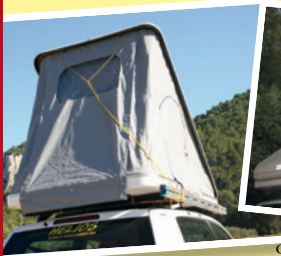
Columbus Variant. This model differs from the previous by its large rear opening