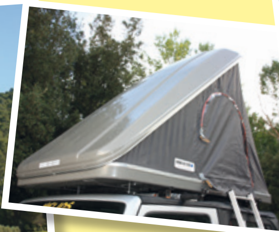
Columbus Carbon. Same construction as the Variant but with a carbon Shell. It costs a little more than 2,600 €. This is the most expensive one on the rooftop tent market.

need a little discipline and not block the lift cylinders with blankets or duvets.