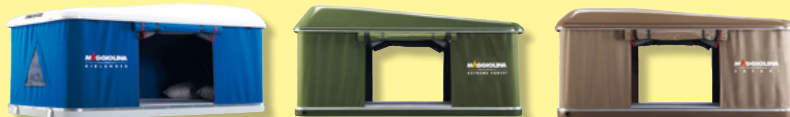
Diferent variations of color for the same model . Here you can feel the Italian fiber and sense of estetic.

7070 TOYOTOTA LAND CRUISERA LAND CRUISER mag N° 5N° 5