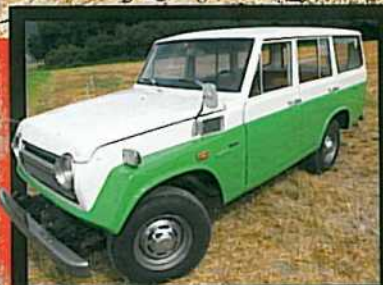
COLLECTOR LE FJ 55 DU BARON

POUR LE FUN OU POUR LA PLAGE LE FJ DE 4X4 EXTREME