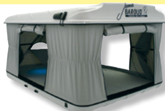
James Baroud Evasion. Un produit «spécial 4x4» destiné aux utilisateurs les plus exigeants.