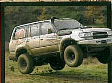
PRÉPA UN 80 BIEN SUSPENDU